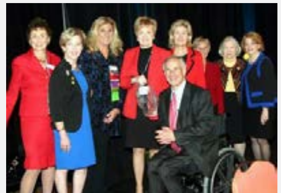
Congresswoman Kay Granger, 2013 (Center)