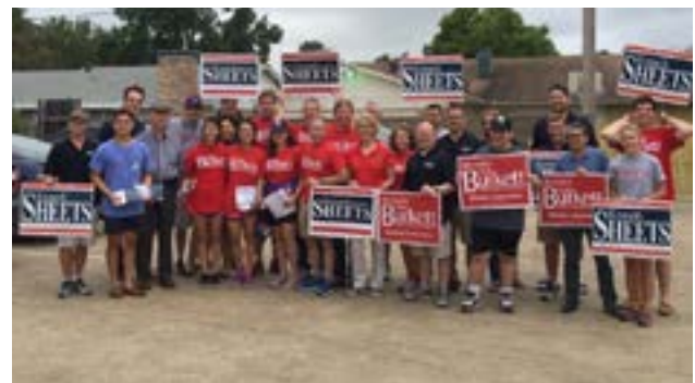
Block Walking for Local Candidates