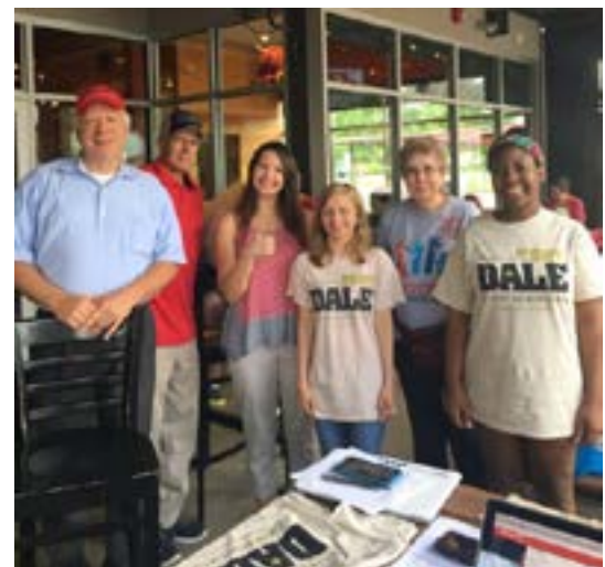
Block Walking for Local Candidates