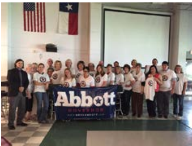
Unite to Win Trainees ready to go to work.