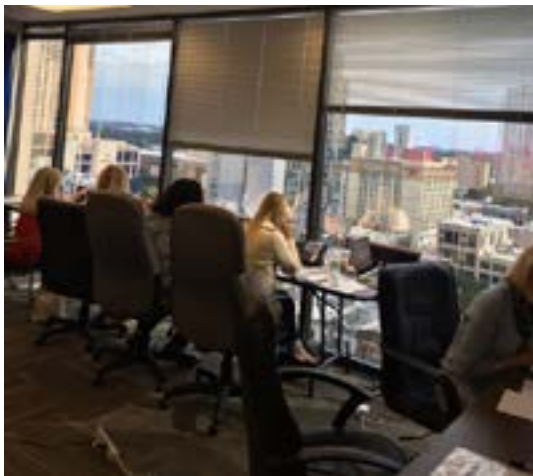
Making Calls to GOTV