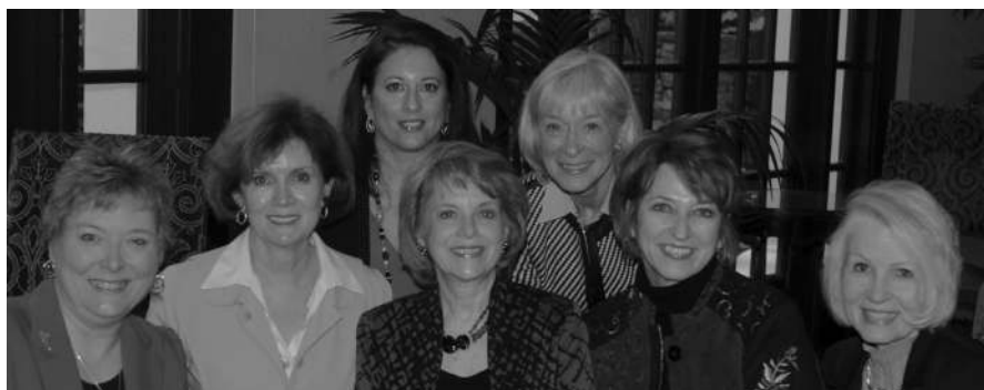
The ladies of the committee.

HEADQUARTERS 515 Capital of Texas Highway, Suite 133 Austin, TX 78746 512-477-1615 (O) 512-480-0709 (fax) tfrw@tfrw.org www.tfrw.org